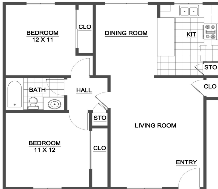
2 BEDROOM UNIT APPROX. 821 SQ.FT.